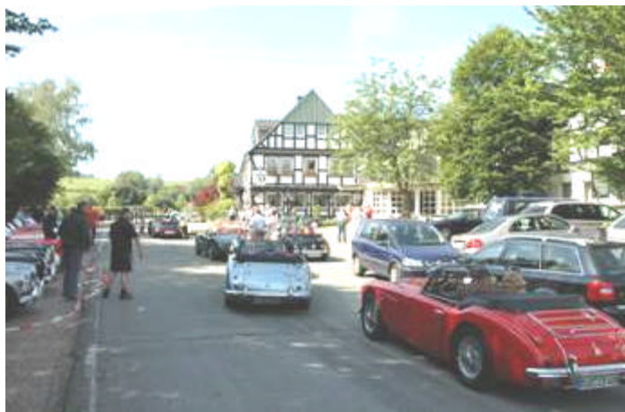
German Healey Club (See P. 3)