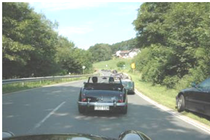
Healeying in Germany (See P. 3)