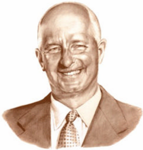
Donald M. Healey

Donald Mitchell Healey, noted British rally driver, automobile engineer, and speed record holder, was born on July 3, 1898 in Perranporth, North Cornwall, England.