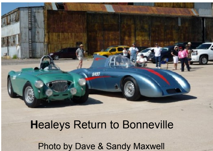
Healeys Return to Bonneville